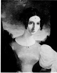
Harriet Taylor (ca. 1834) Portrait in the possession of Professor F. A. von Hayek