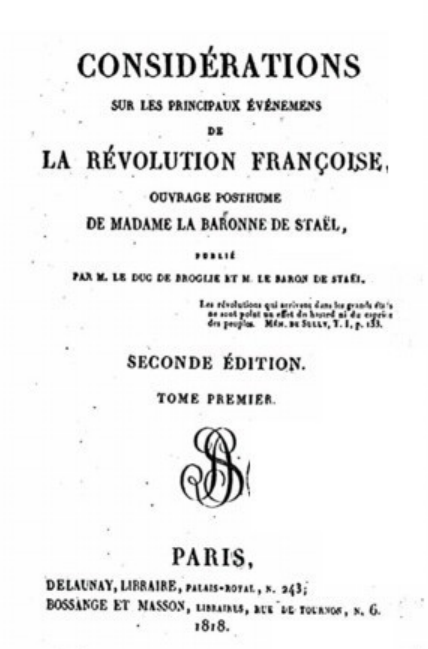
<u>Considerations on the Principal Events</u> of the French Revolution