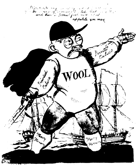
The GIANT COMMERCE

"The Saint-Simonians in Industry and Economic Development." American Journal of Economics and Sociology 38(January 1979):83-96.