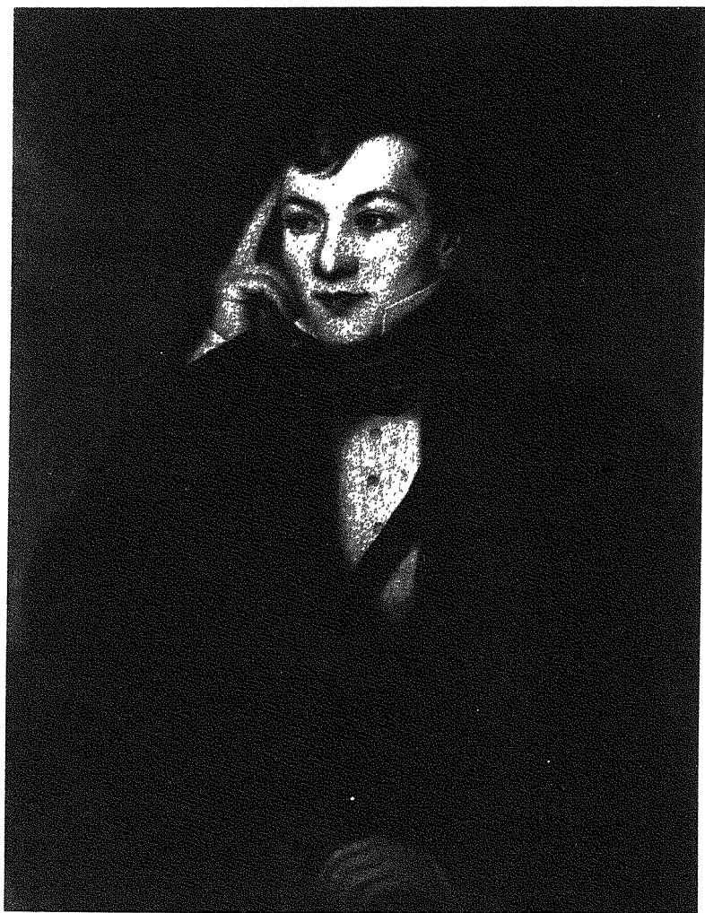
Richard Cobden at about twenty six