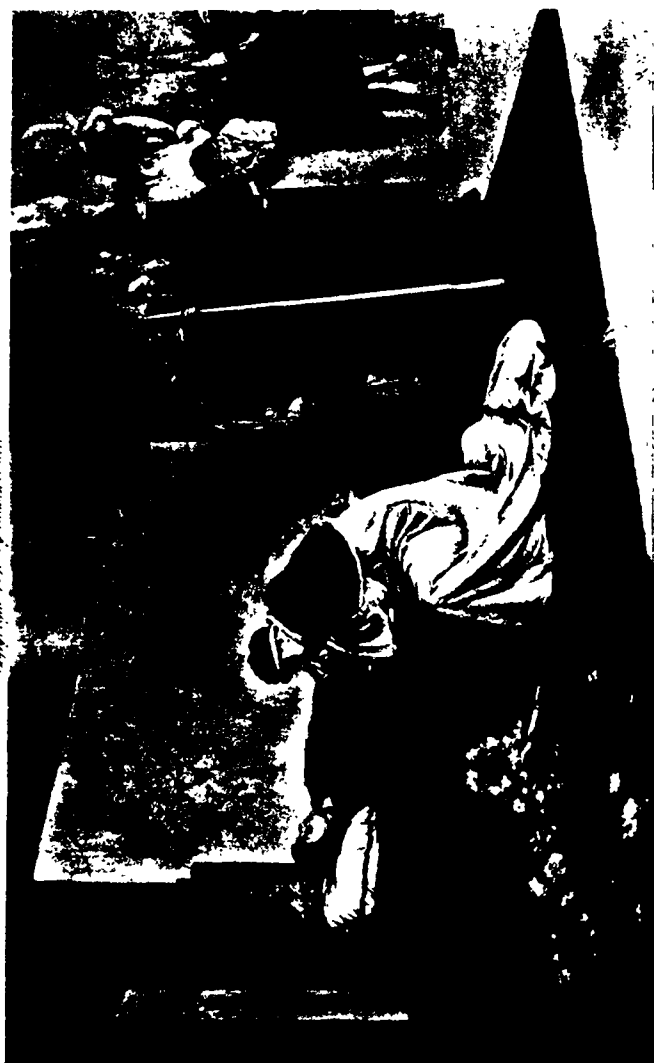
Highway work, 1911. Top of tunnel to Well.