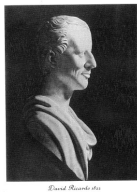
David Ricardo 1822 from a bust made at Florence.