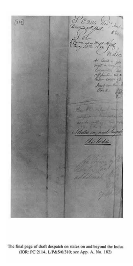
>The final page of draft despatch on states on and beyond the Indus

(IOR: PC 2114, L/P&S/6/310; see App. A, No. 182)