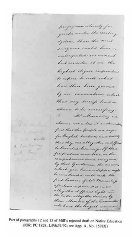
>Part of paragraphs 12 and 13 of Mill's rejected draft on Native Education

(IOR: PC 1828, L/P&J/1/92; see App. A, No. 1578X)