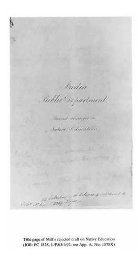
>Title page of Mill's rejected draft on Native Education

(IOR: Dr 246, E/4/711; see App. A, No. 1)