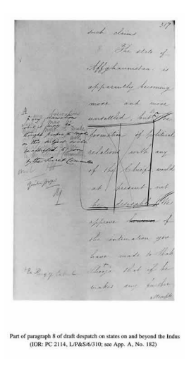
>Part of paragraph 8 of draft despatch on states on and beyond the Indus

(IOR: PC 2114, L/P&S/6/310; see App. A, No. 182)