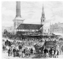
“Nomination of Candidates for Westminster at the Hustings, Charing Cross” Illustrated London News, 21 November 1865, p. 405