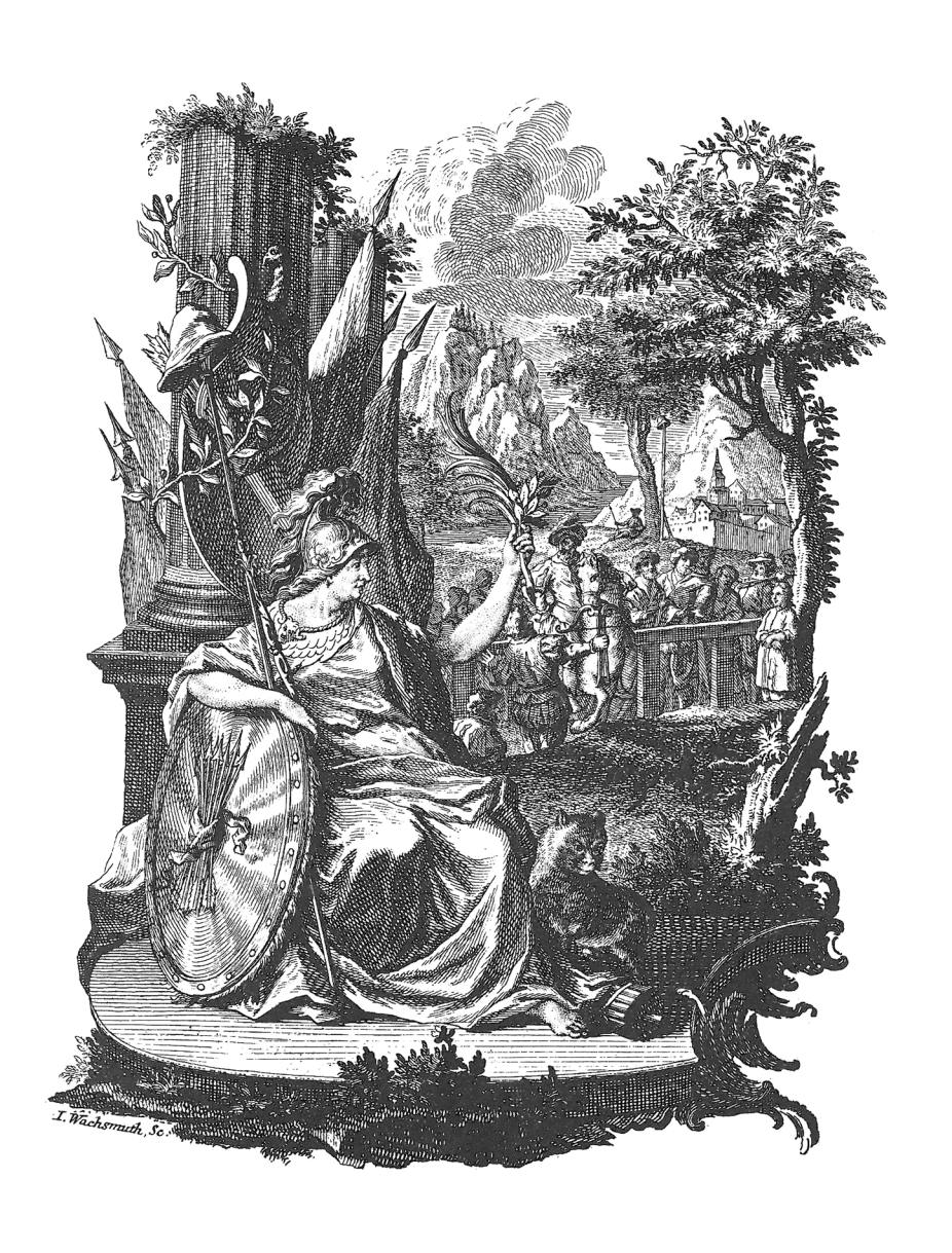
Libertas (Liberty) In the foreground sits a female figure for liberty, with various symbols of liberty, victory, and peace. In the background the story of William Tell is depicted.