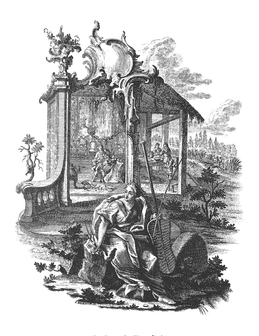
Res Domestica (Frugality)

A woman with compasses (for measuring resources) in her right hand and a wand and ship's rudder (for household leadership) in her left (alongside beehive). In the background, a rich dissolute household is depicted on the left, a modest and frugal household on the right.