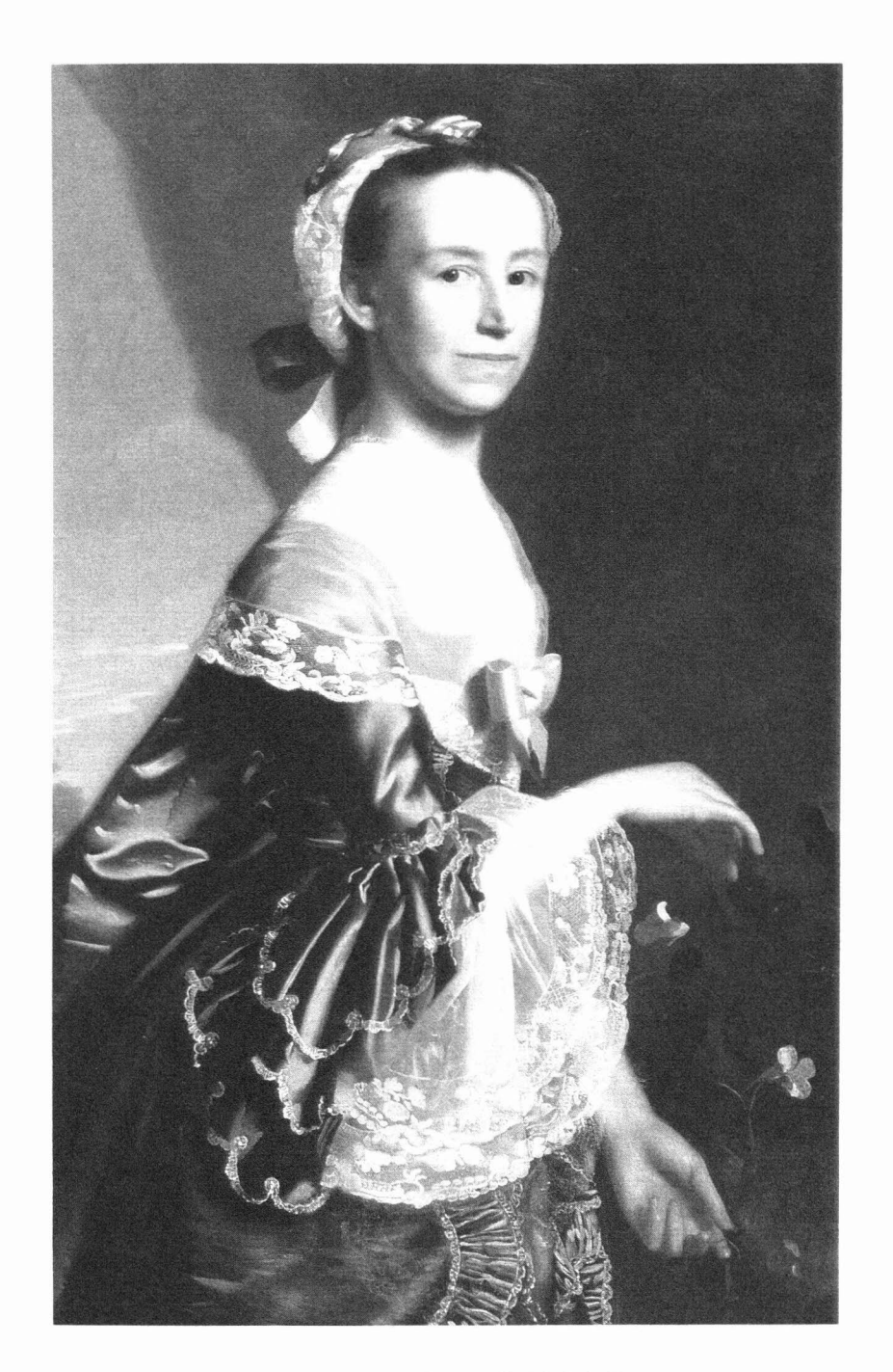
MERCY OTIS WARREN