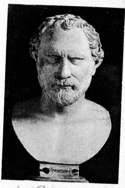
Demosthenes from a bust in the Louvre.